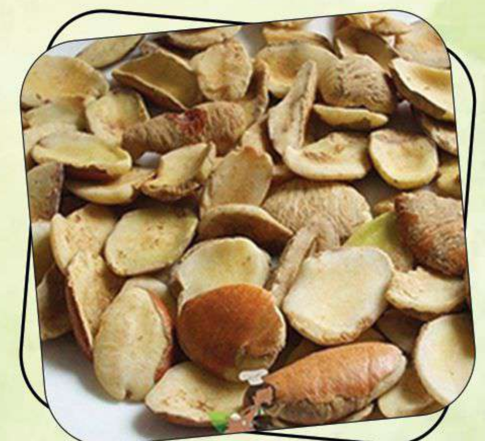
Irvingia Gabonensis Seeds Extract