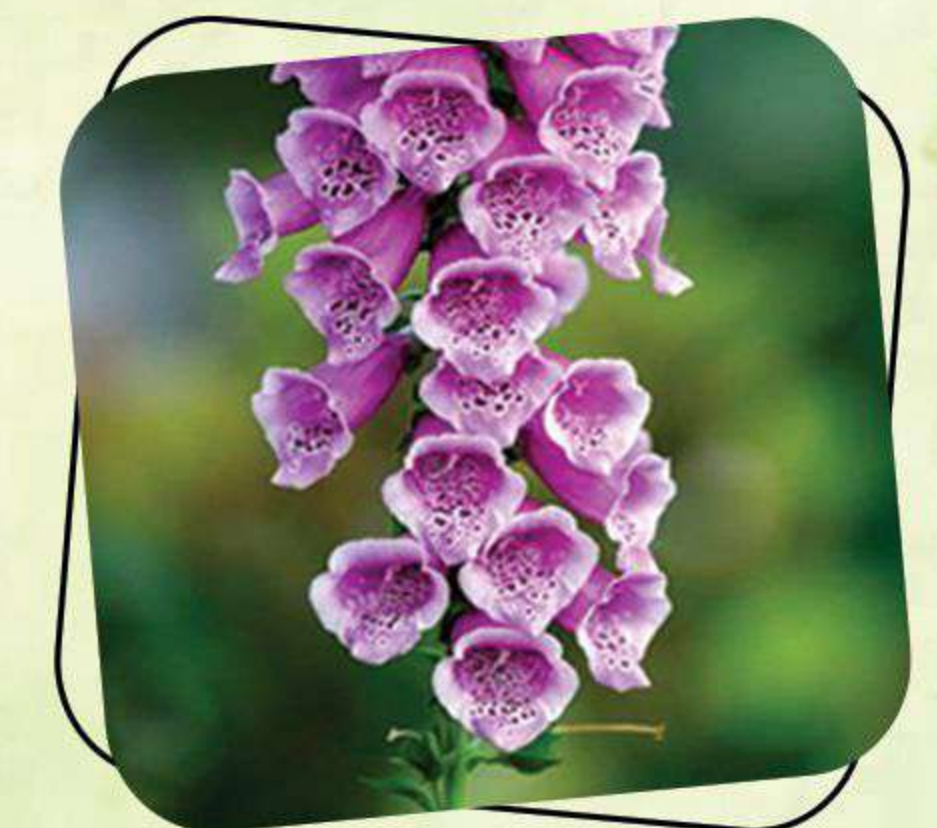
Digitalis Lanata Extract