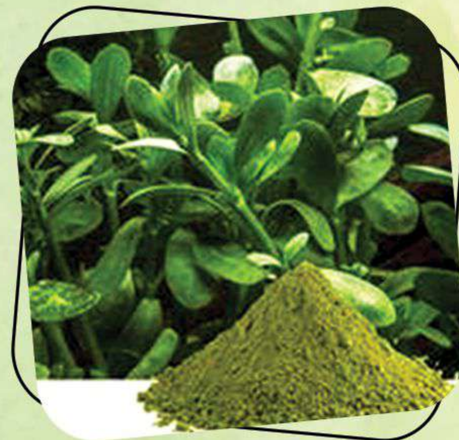
Bacopa Monnieri Extract