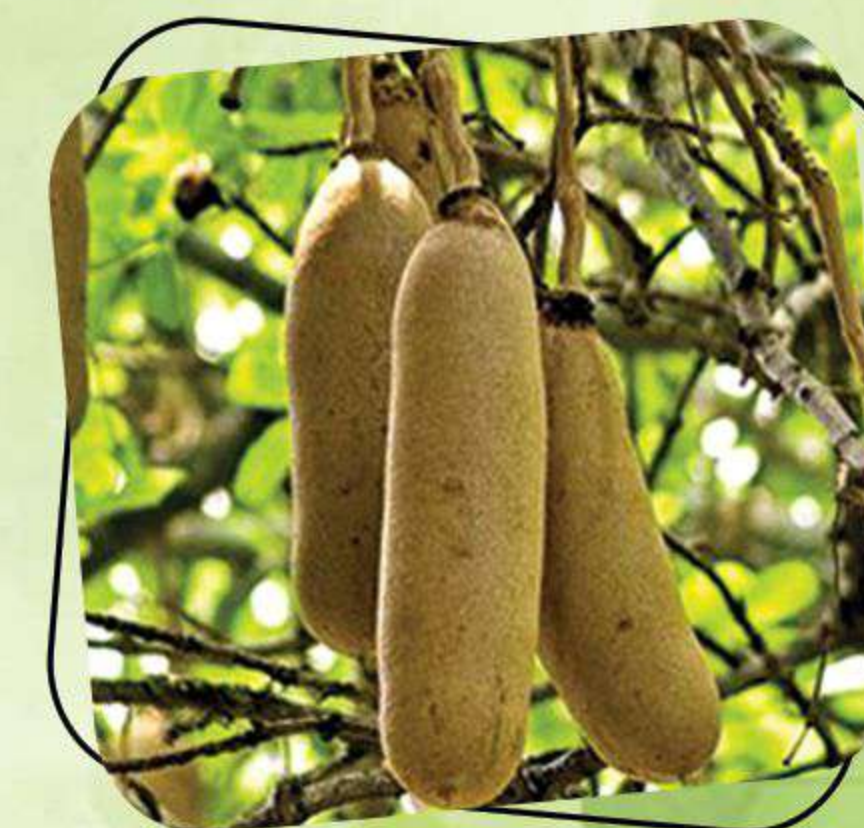
Kigelia Africana Extract