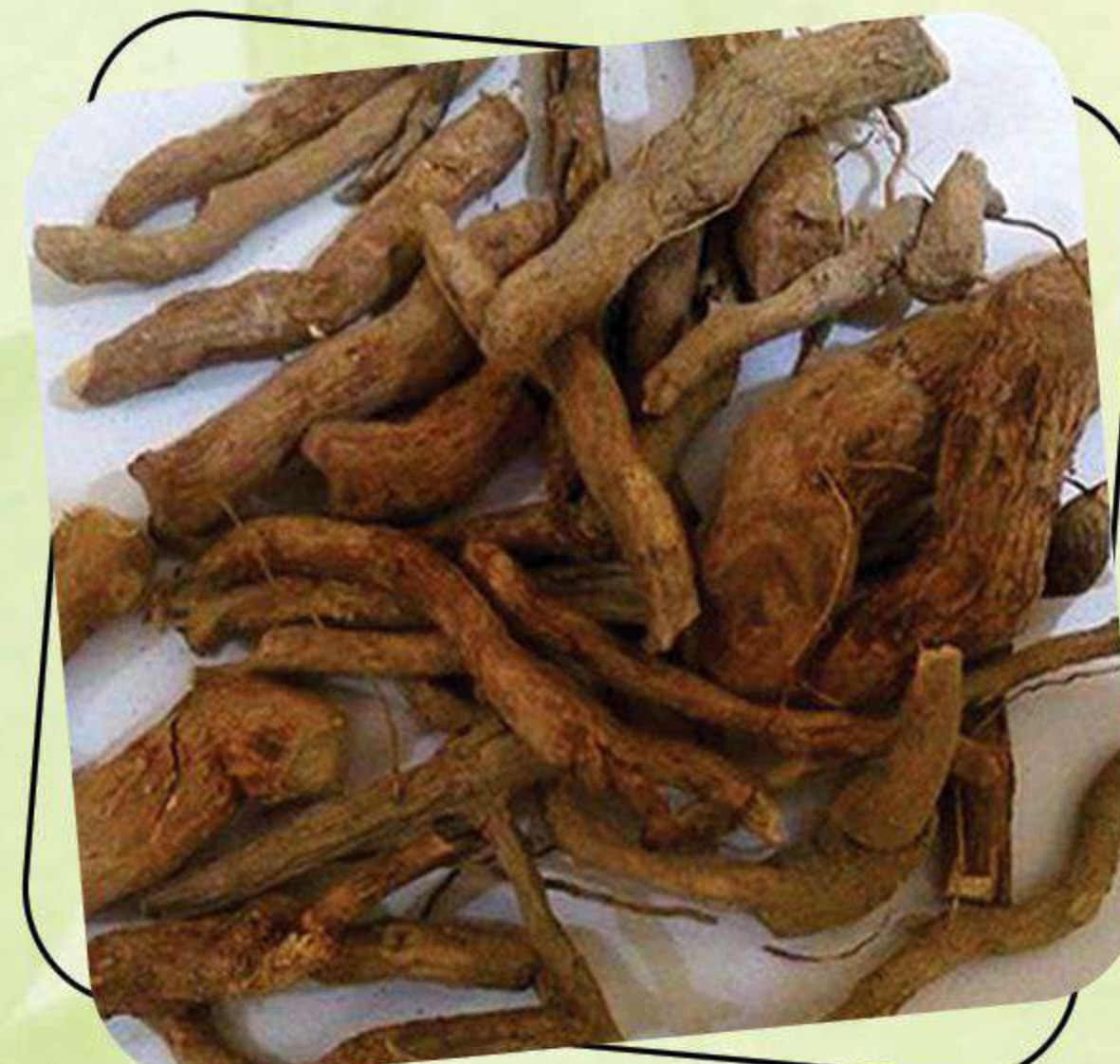
RESERPINE CHINA DMF NO - Y20170001557