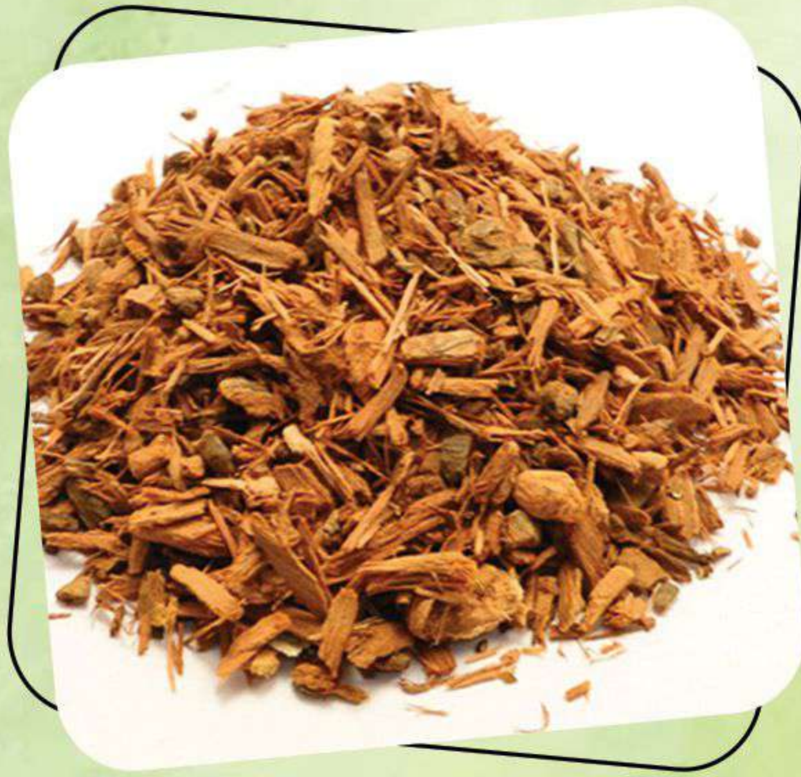
PYGEUM BARK SOFT EXTRACT US DMF NO - 32163