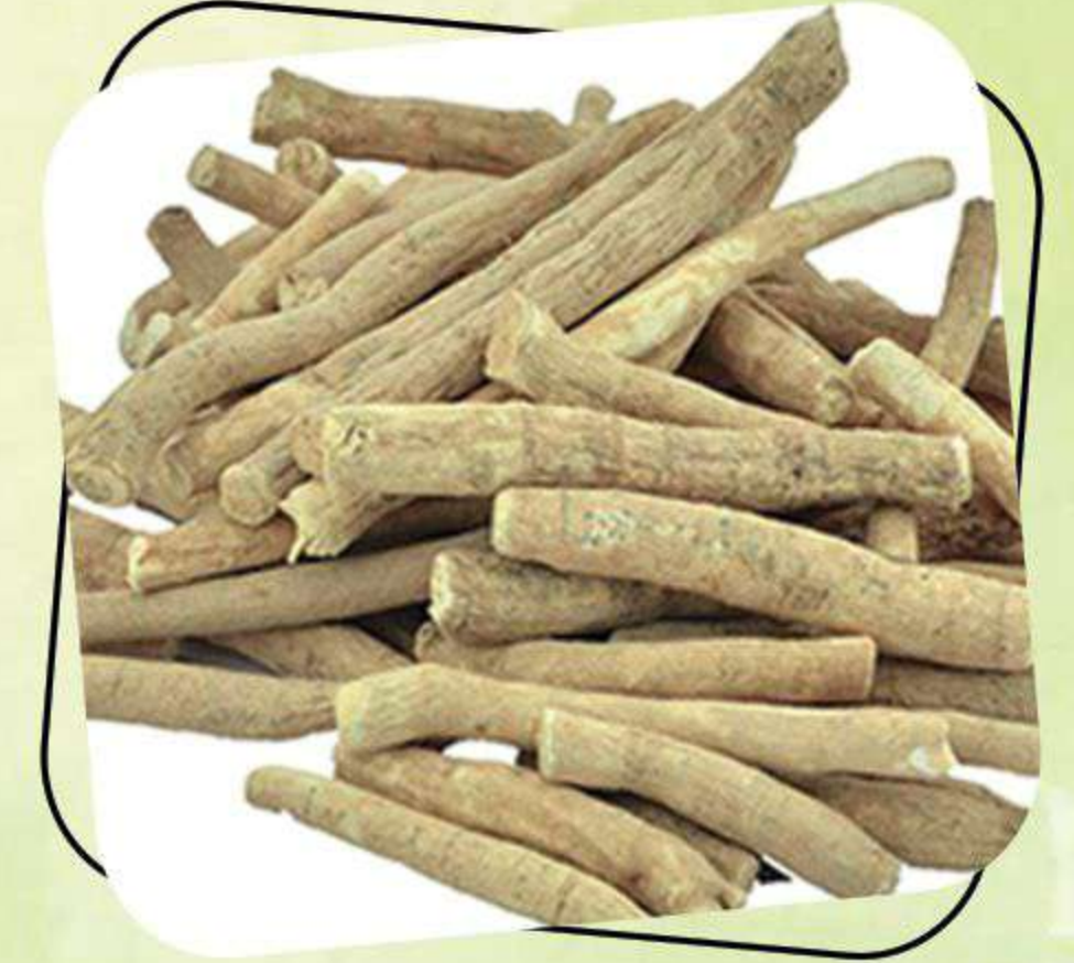
Withania Somnifera Extract