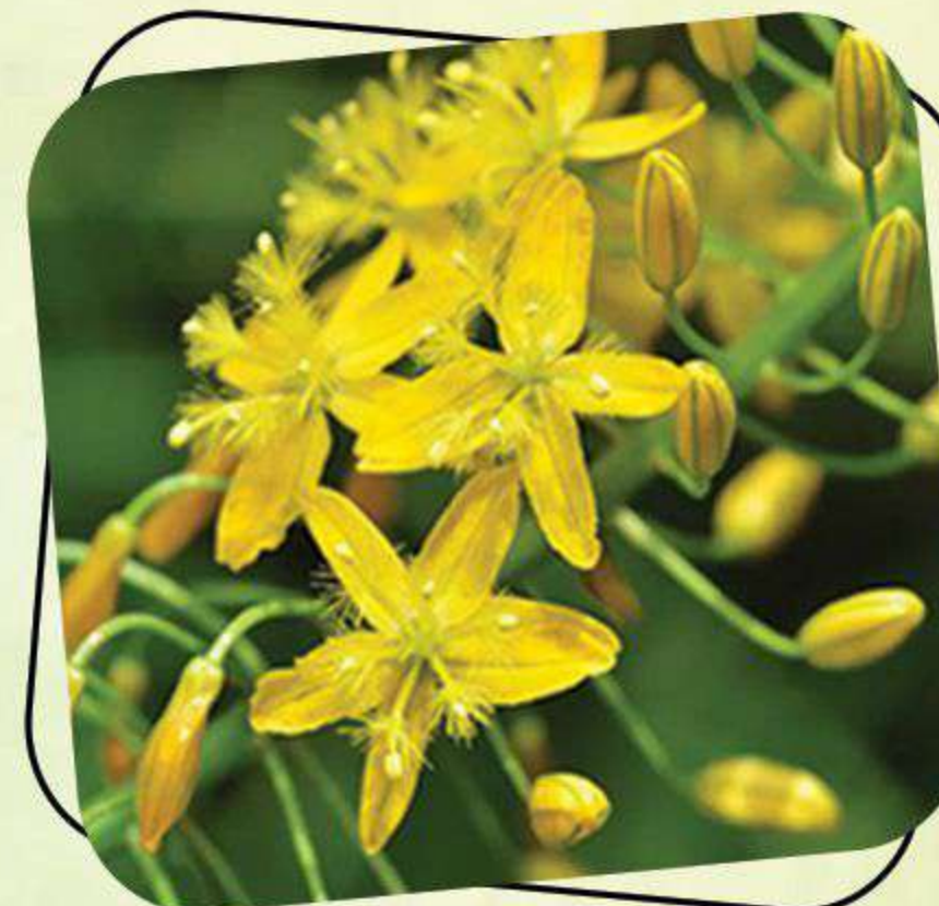
Bulbine Natalensis Powder Extract