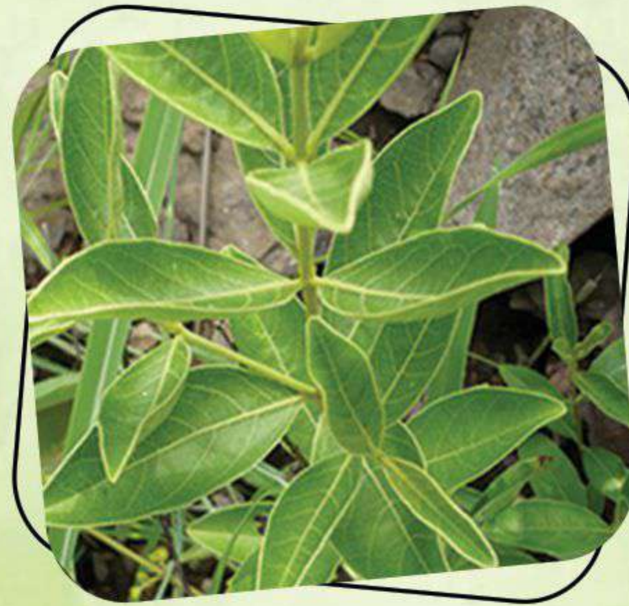
Fadogia Agrestis Extract