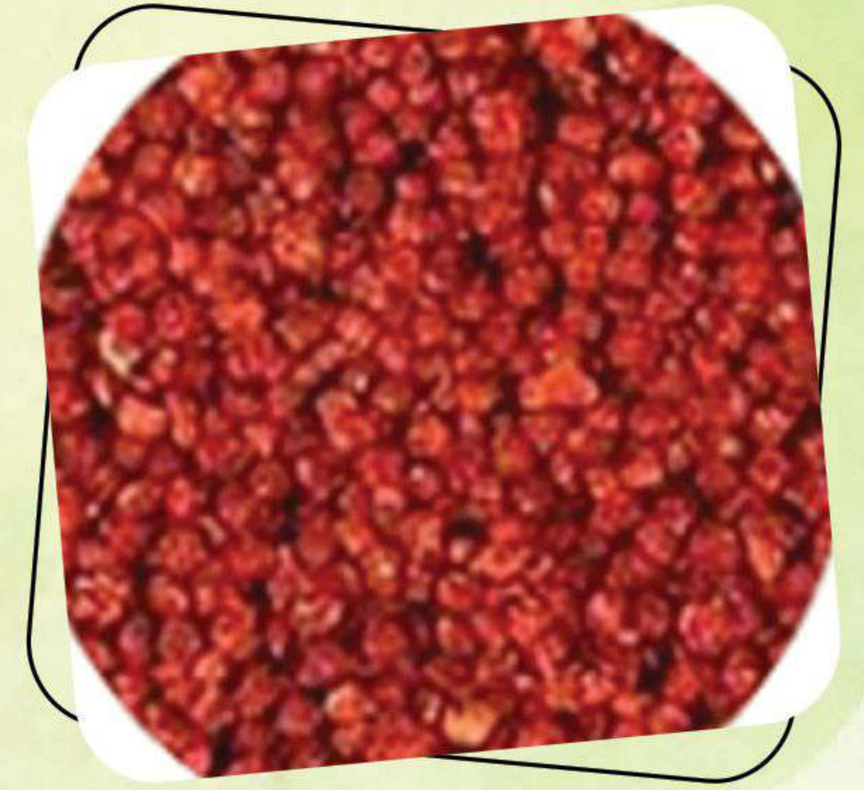
THIocolchicoside CEP NO - R0-CEP 2019-282 US DMF NO - 32070