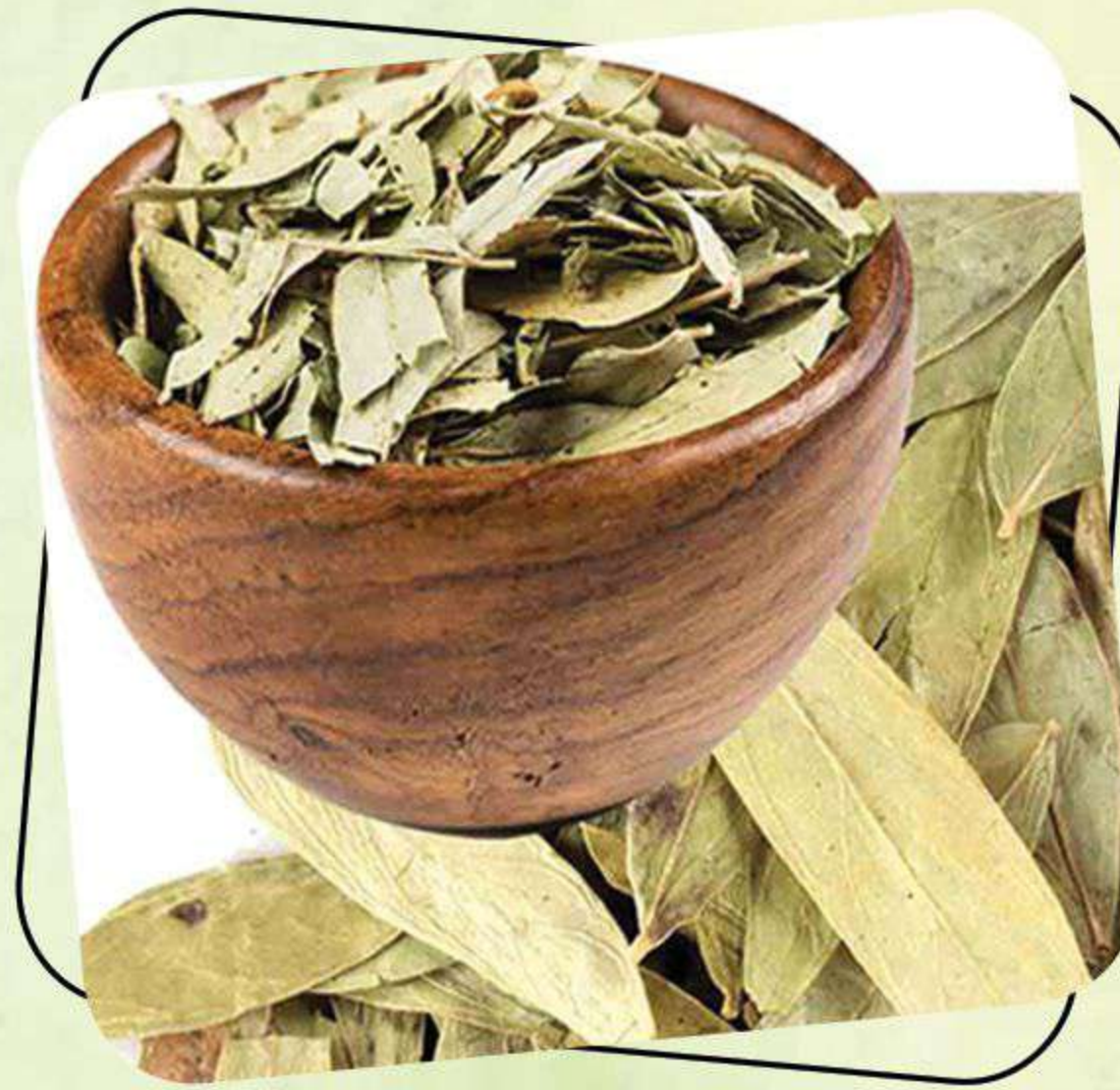
CALCIUM SENNOSIDES US DMF NO - 32164