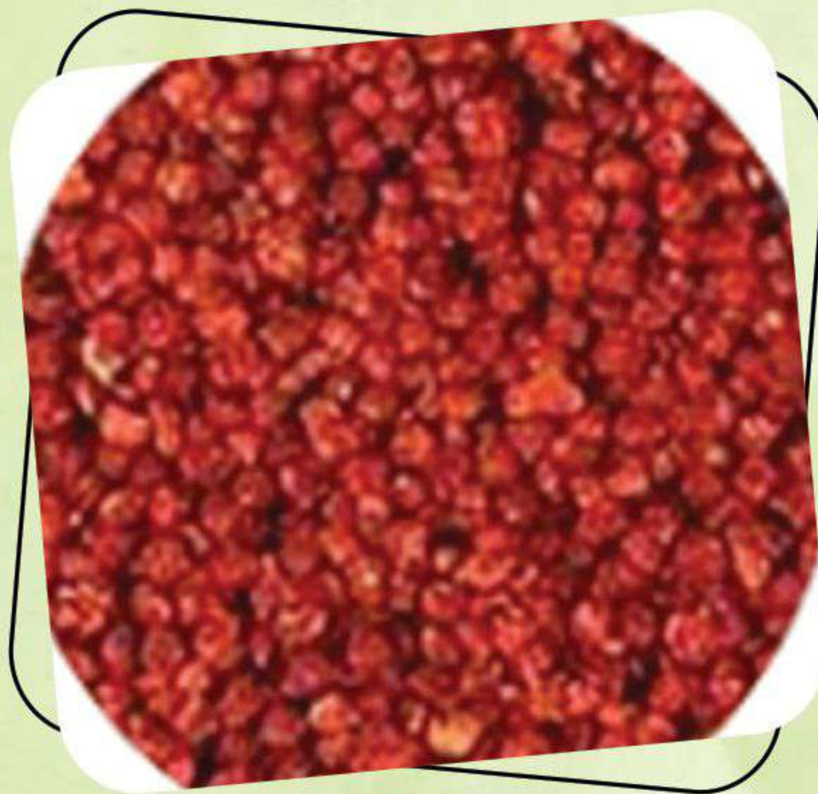
COLCHICINE US DMF NO - 32072