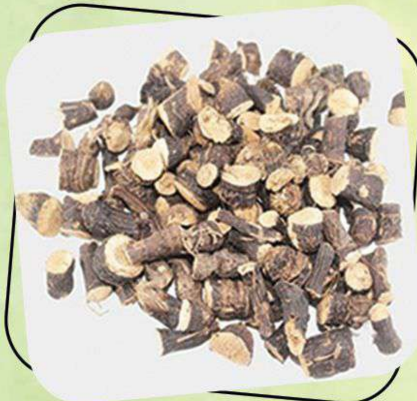
Curculigo Orchioides Extract