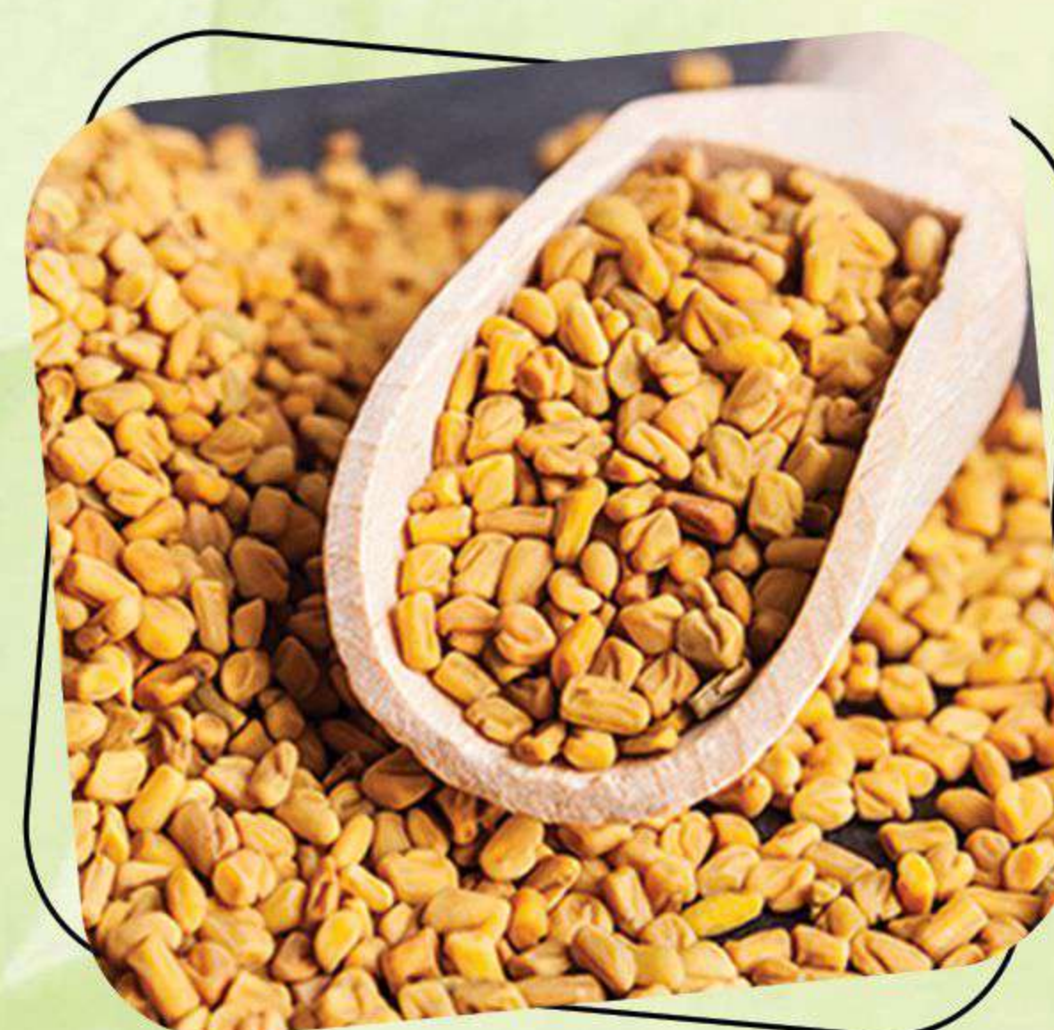
Fenugreek Seeds Extract (Protodioscin)