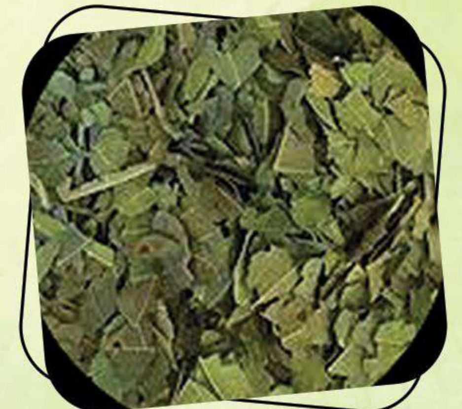
Mangifera Indica Leaf Extract