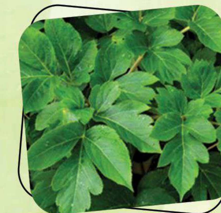
Ashitaba Leaf Extract