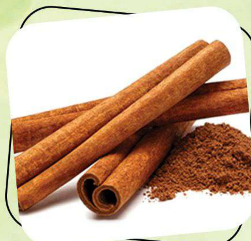
Cinnamomum Verum Bark Extract